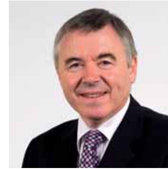
Ieuan Wyn Jones